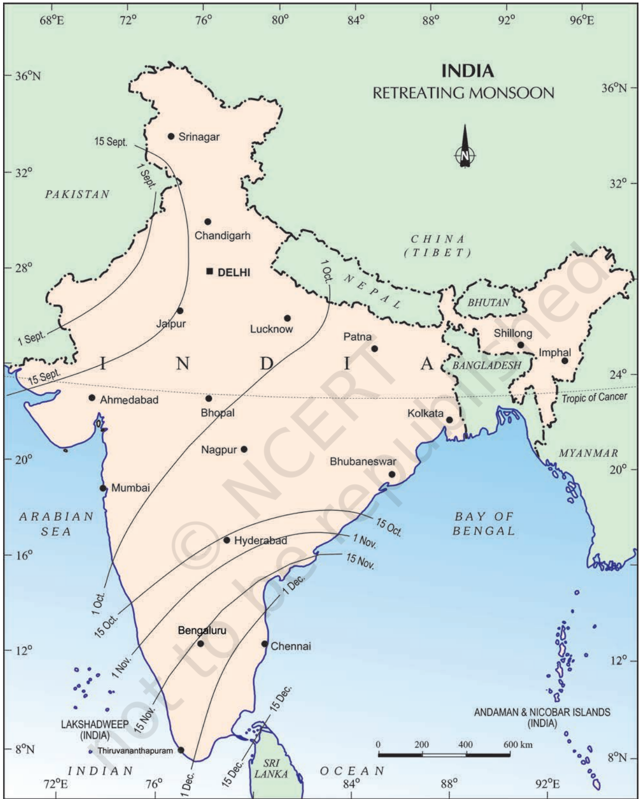
Figure 4.2 : Retreating Monsoon