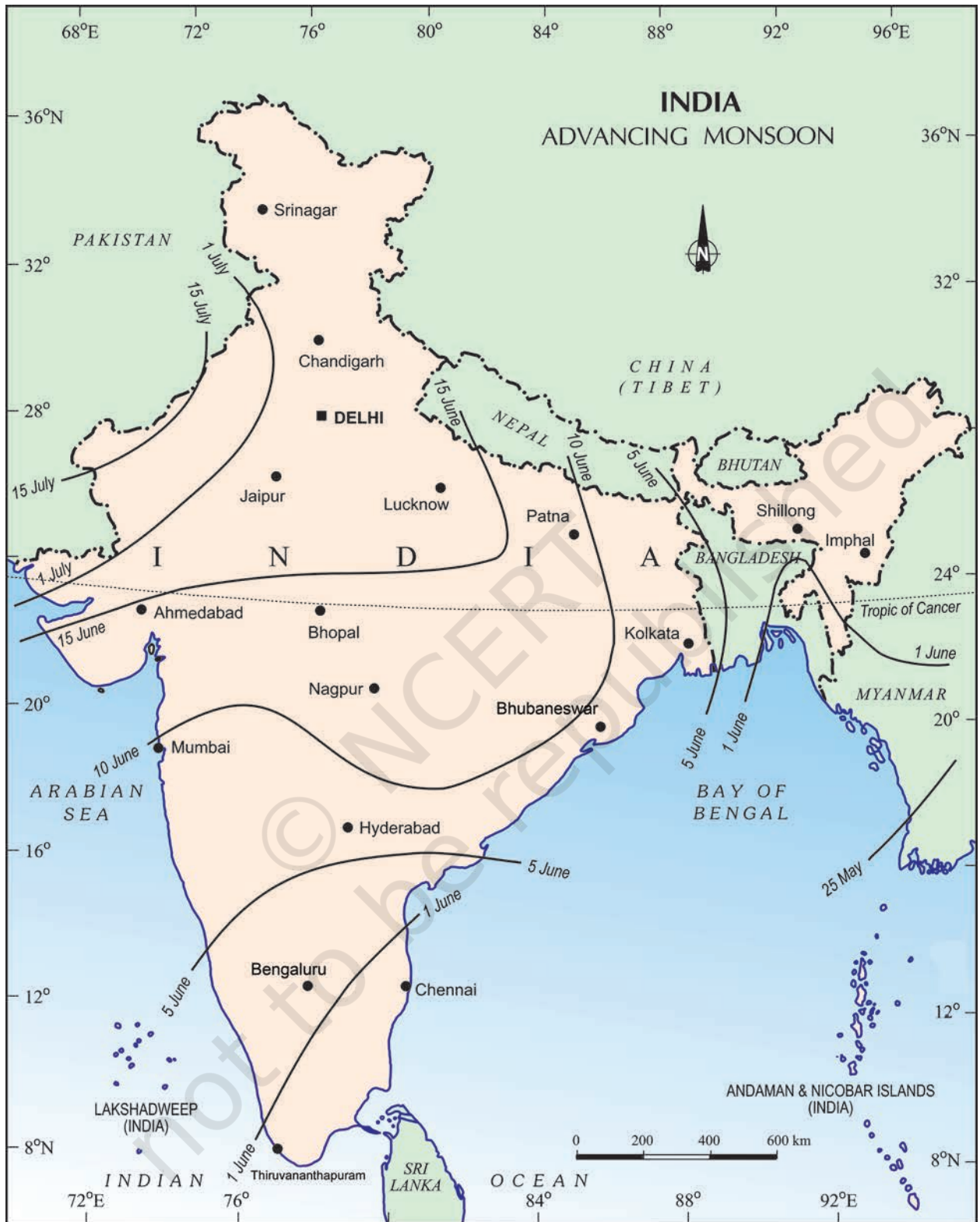
Figure 4.1 : Advancing Monsoon